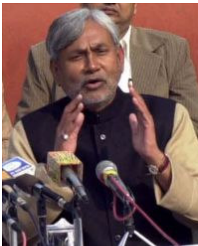
Chief Minister Nitish Kumar

Earlier, Chief Minister Nitish Kumar told the state assembly that his government had brought